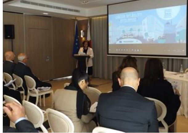
Figure 2: Workshops with hotels to launch the Green Mobility Hotel award and labelling scheme

The deadline for submission of applications for the Award was 30 September 2019. Hotels could apply individually or in a partnership with nearby hotels. Hotels needed to obtain the Green Mobility Label, by proving that they had a Green Mobility Plan in place, before being able to submit a proposal to the Green Mobility Hotel Award. The label established that the hotel had suitable operational measures and management practises in place that demonstrated commitment to promoting green mobility, such as having a Green Mobility Plan in place and providing information on sustainable mobility to guests and staff.