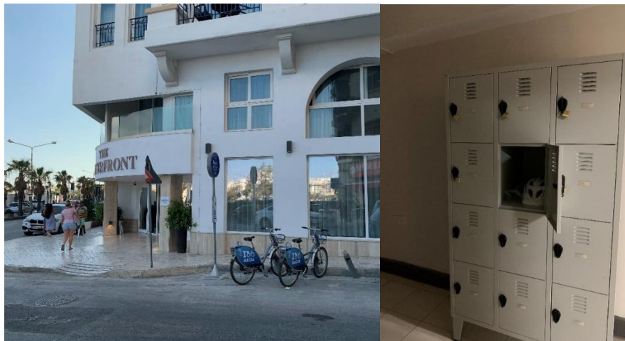
Figure 4: Installed bicycle sharing station and lockers at The Waterfront Hotel

Figure 5 presents some responses by hotels to the question “In your opinion, what are the benefits of the Green Mobility Hotel Award and Labelling Scheme?”.