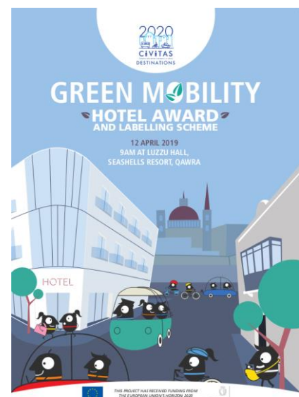
Figure 1: Advertisement for workshop shared with hotels

Based on desktop research and stakeholder consultation with hotel industry representatives, the competition guidelines and award evaluation criteria were drafted by the external consultants and finalised after discussion with Ministry for Tourism, Transport Malta and University of Malta.