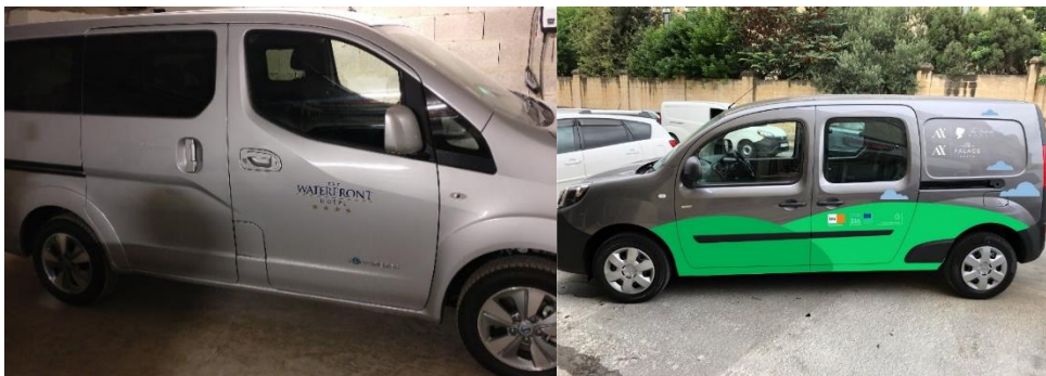
Figure 3: The new electric van at The Waterfront Hotel (Nissan e-NV200) and The shared electric van to be used for passenger transport by the partnership of hotels (Renault Kangoo ZE)

The individual hotel proposed a collection of measures (an electric passenger van, installation of a bike station accommodating 8 bicycles to be rented through an app, and the provision of cycling helmets and lockers), as shown in Figure 3 and 4. The partnership of hotels proposed the purchase of an electric passenger van, to be shared between the hotels for use by their visitors. The vehicles were wrapped with imagery and logos of the project (Figure 3).